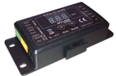
Flex Pixel Driver ( FLE768 )