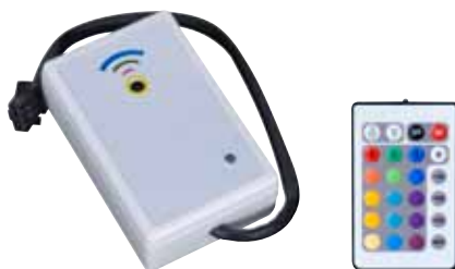
Flex Pixel IR ( FLE755 )