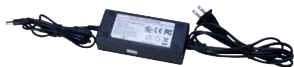
FLEX PIXEL 5VPSU ( FLE781 )