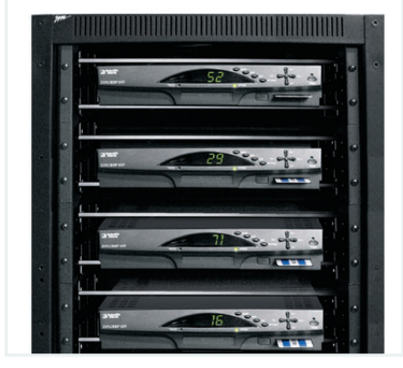
OCAP-3 (shown) uses three space model for greater heat dissipation, use two space model for high density mounting

EIA compliant 19" lamping rackshelf for cable / satellite box shall be Middle Atlantic Products model # OCAP - (2,3). Rackshelf shall occupy (2,3) rackspaces. Rackshelf shall feature adjustable, foam padded mounting and clamping bars to secure component while preventing scratches and allowing greater heat dissipation. Clamping rackshelf shall be constructed of 16-gauge steel with a 25 lb. weight capacity. Unit shall be finished in a durable flat black powder coat. Clamping rackshelf shall be manufactured by an ISO 9001 and ISO 14001 registered company. Clamping rackshelf shall be warrantied to be free from defects in material or workmanship under normal use and conditions for the lifetime of the product.