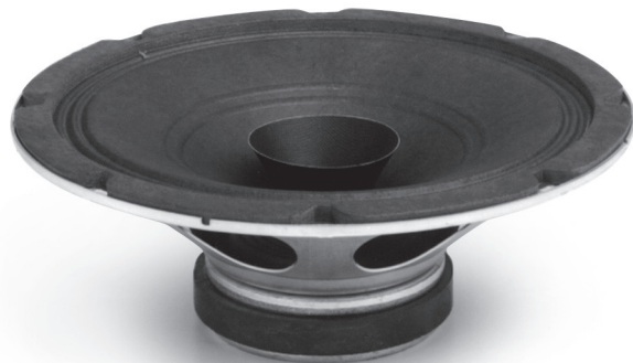
C10A Series Speaker

Pre-Assembled 8" Loudspeaker & Baffle for use with IP Speakers