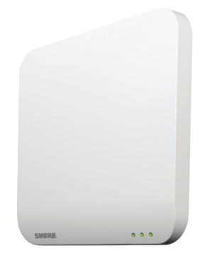
MXWAPT Access Point Transceiver