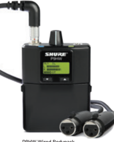
P9HW Wired Bodypack