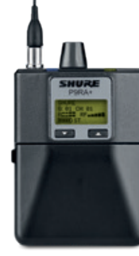
P9RA+ Wireless Bodypack Receiver