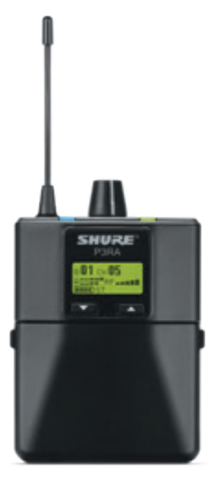
P3RA Premium Wireless Bodypack Receiver