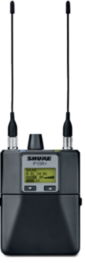
P10R+ Wireless Bodypack Receiver