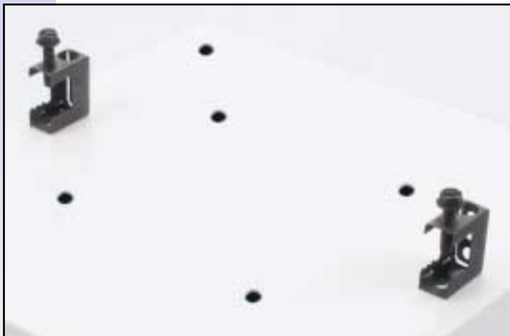
Screws in UP position

The SBMS is ideal for "big box" retail stores whose special design calls for an open beam ceiling. Since the goals are to get customers to pay attention to the announcements of specials and the employees to respond to general paging—intelligibility is a top design goal. The high efficiency of the specially designed 8" speaker included in the SBMS package fills this requirement.